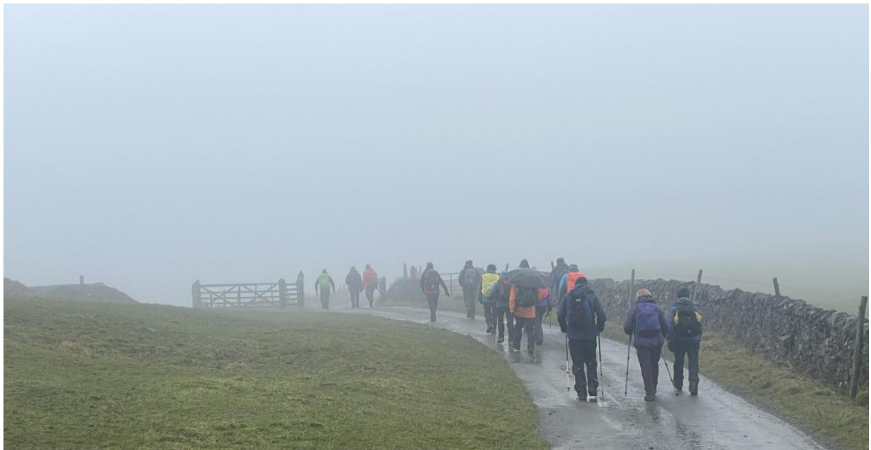
The long and winding road....